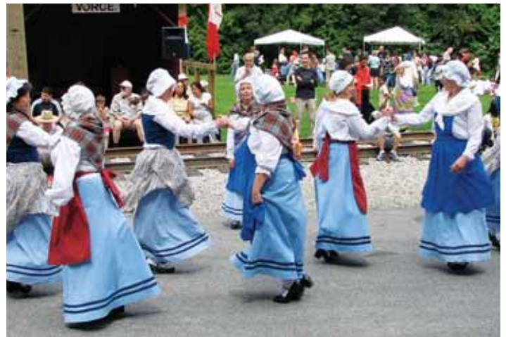
French-Canadian dance by Burnaby International Folk Dancers, Multicultural Day.

Heritage Christmas, November 24, 2007-January 1, 2008