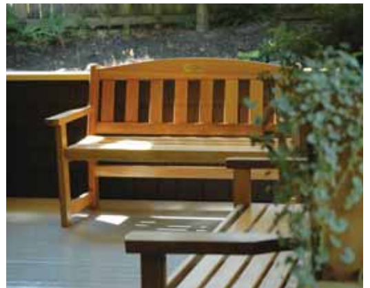
Benches and planters donated by the Burnaby Rhododendron and Garden Society.