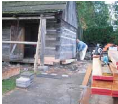
Log cabin deck and floor repair.