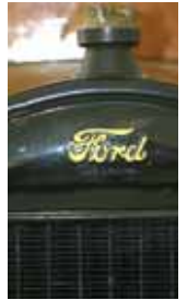
1924 Model T radiator.