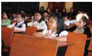
Attentive students attend the 4th Annual Burnaby Schools Spelling Bee.