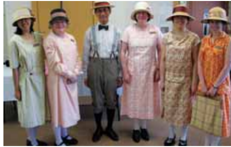
Museum Interpreters and volunteers on Canada Day.