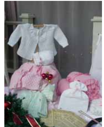
Bell's Dry Goods window.