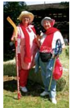
Visitors pose at the "Canadian Gothic" station during Canada Day.