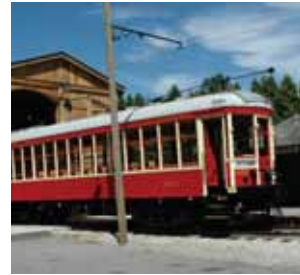
Restored Interurban 1223.