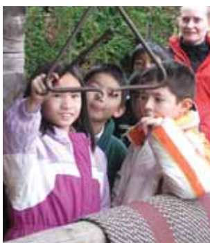
Students ring the log cabin's triangle during the Home Sweet Home program.