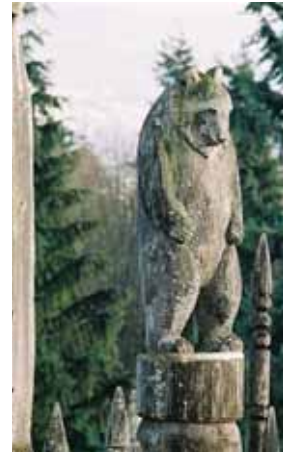
Playground of the Gods: before surface cleaning.