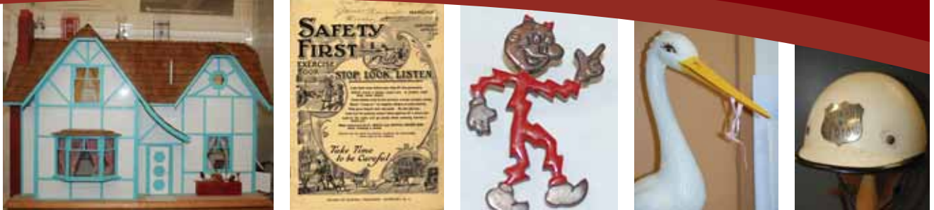
Artifacts donated to the BVM in 2007 included (l to r): a PNE prize-winning doll house, a children's notebook featuring a tram safety message, a pin featuring "Reddy-Kilowatt" (the B.C. Electric Railway mascot), a fixture from Helen's Children's Wear, and a Burnaby motorcycle policeman's helmet.