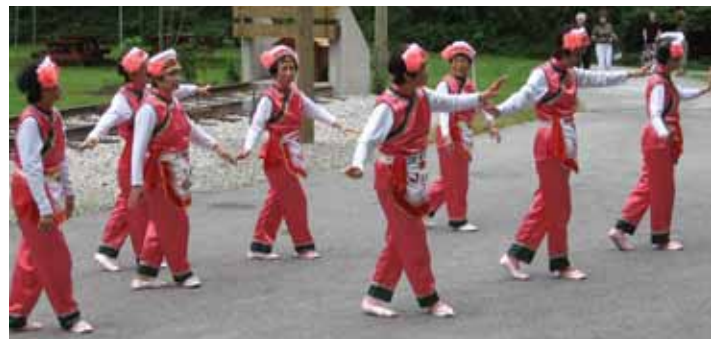
The North Burnaby Retired Chinese Dancers perform at the Multicultural Festival.