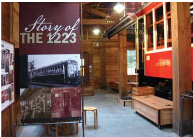
Inside the new Tram Barn exhibit.