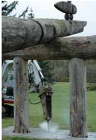
Playground of the Gods: cement removal.