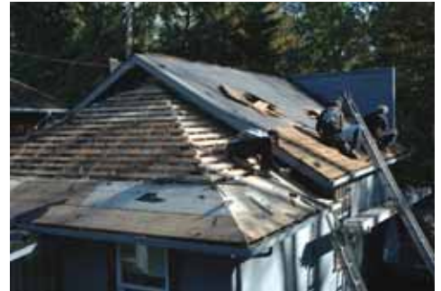
Bell's Dry Goods roof repair.