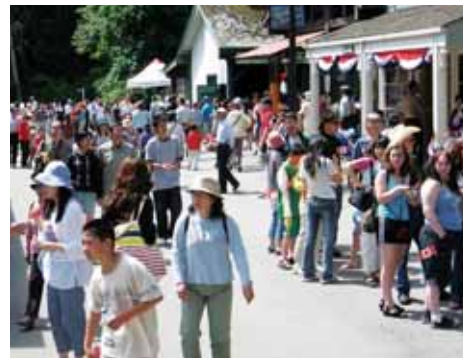
Canada Day visitors.