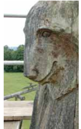
Playground of the Gods: after surface cleaning.