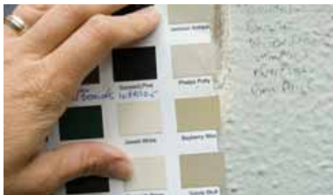
Elworth exterior paint history research.