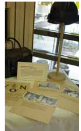
Victorian Order of Nurses display at the Kingsway Library.

Great info and not too imposing. I liked the relaxed approach.