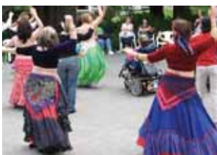
The Egyptian Breeze Dancers engage the public during the Multicultural Festival.

So great! It inspires me to write a book.