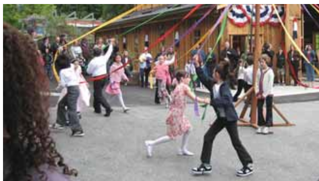
Leigh Elementary students perform the Maypole Dance on Victoria Day.

The Rivers to Sea Regional Historica Fair continues to be very successful. This year, the numbers of participating schools, school districts and sponsors all doubled from last year's numbers. The ties with