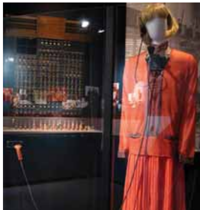
Women at Work exhibit features a 1920s telephone operator.