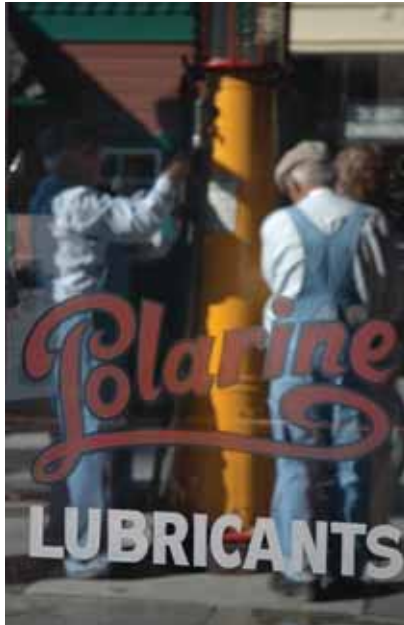
Conservation volunteers at work.