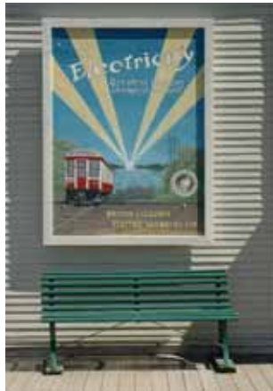
B.C. Electric Railway billboard.