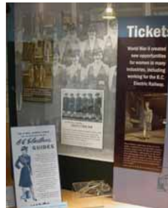
Tickets Please! display tells the story of women who worked for the B.C.E.R. during WWII.