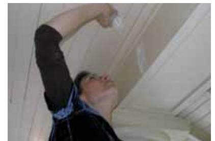
Paint history on Elworth front porch.