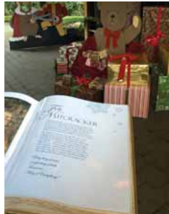
The Nutcracker is brought to life for a Storybook Christmas.