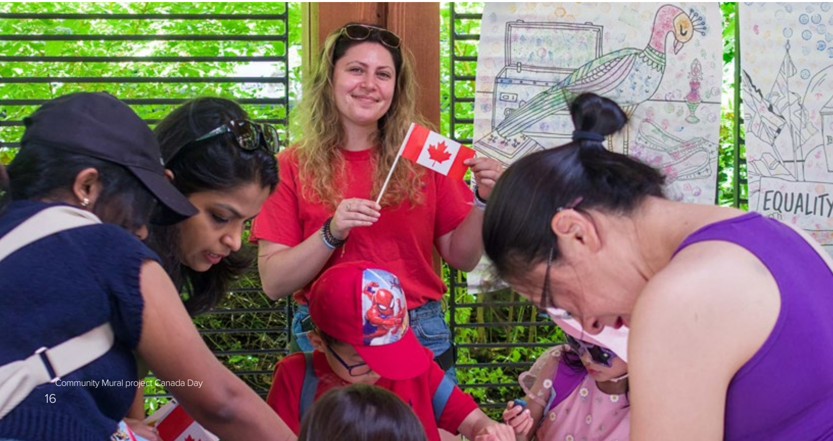
Community Mural project Canada Day