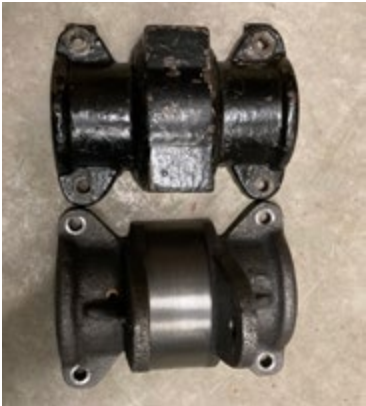
(left) Internal view of the band organ. (right top) Carousel and conservation staff conducting repairs. (right bottom) Newly machined castings.