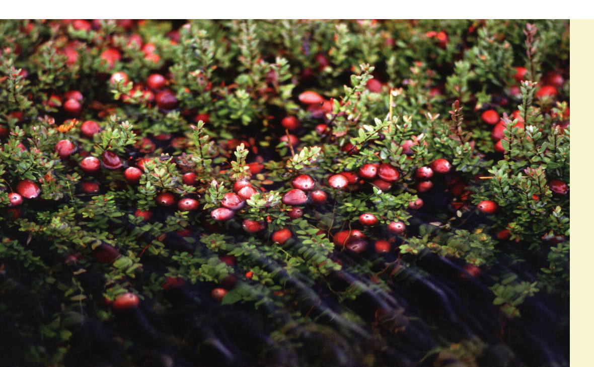
Cranberries grow in bog-like habitats, which were once prevalent in Burnaby's marshland areas.