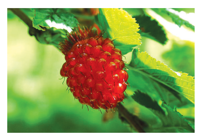
Salmonberries and their fresh shoots were eaten in the spring. Original uploader was Apv at en.wikipedia, Photograph by Ashley Pond V, May 24, 2006.

Land alienation and industry resulted in a loss of traditional resource areas, and at times created economic incentives for overharvesting. Cascara bark, a prime ingredient for laxatives, is an example of a commercially sought-after resource that is still available on Burnaby Mountain. This medicinal plant was harvested commercially by many həńgəmińəm and Skwxwú7mesh families in the early 1900s. Gathered in the spring, the bark had to be processed and dried before sale. By 1904, həńqəmińəm and Skwxwú7mesh resource use in the Burnaby Mountain area was disrupted by logging, with the appearance of the logging road that later became Curtis Street. Within a decade. the mountain was cleared. It is now covered with second growth forests of maple, cedar, alder, hemlock, and Douglas fir.